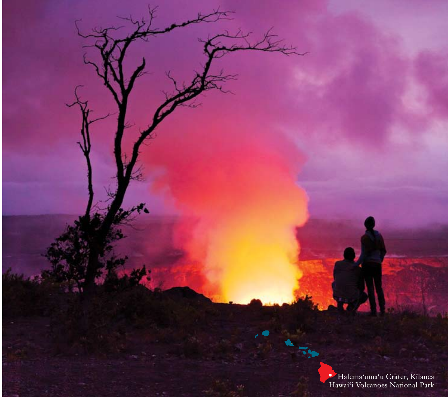
Halema'uma'u Crater, Kilauea Hawai'i Volcanoes National Park

From breathtaking land and seascapes to uncommon luxuries, find your inspiration on Hawai'i, the Big Island. Your journey starts here - gohawaii.com/hawaii-island .